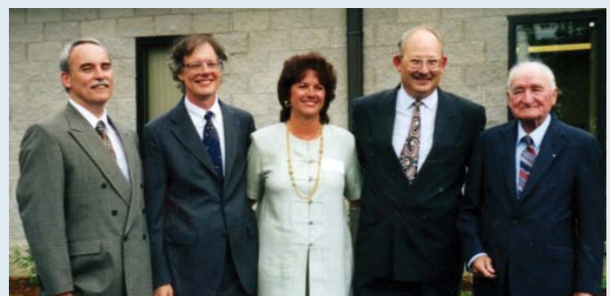
Pictured from years ago are all the Executive Directors the AAA7 has had over the past 45 years!