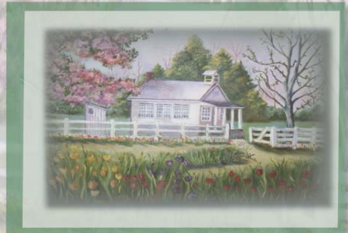
2008 “Victor Potts Award” Winner

May 18 - 29- 2009 10 am - 2 pm, Monday - Friday Greer Museum University of Rio Grande Rio Grande, Ohio